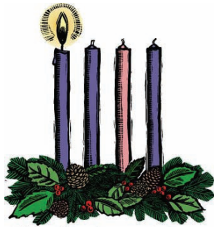
First Sunday in Advent

In the Advent liturgies we remember and celebrate the first advent and coming, which was Christ's birth; we look forward with expectancy to Christ's coming at the end of time. We also celebrate and recognize the advent, the coming, of the Christ of love, the Christ of justice and peace, today, right here and now.