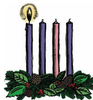
First Sunday in Advent